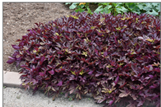
SolarPower Red Sweet Potato Vine