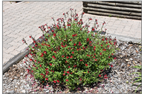
Radio Red Autumn Sage in bloom

Radio Red Autumn Sage is a fine choice for the garden, but it is also a good selection for planting in outdoor pots and containers. It is often used as a 'filler' in the 'spiller-thriller-filler' container combination, providing a mass of flowers against which the larger thriller plants stand out. Note that when growing plants in outdoor containers and baskets, they may require more frequent waterings than they would in the yard or garden.