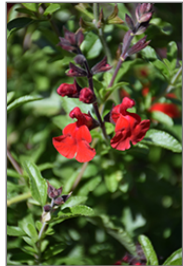
Radio Red Autumn Sage flowers