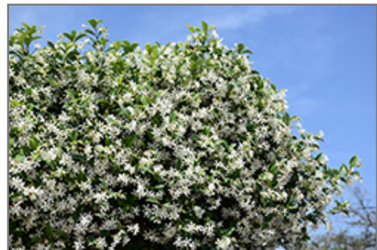
Madison Star-Jasmine flowers