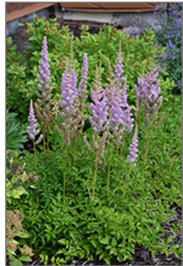
Dwarf Chinese Astilbe in bloom