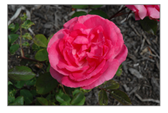
Tahitian Treasure Rose flowers