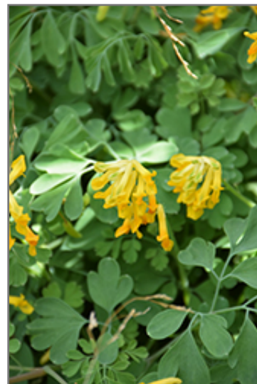
Golden Corydalis flowers