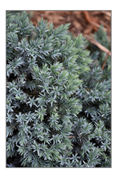
Blue Star Juniper foliage