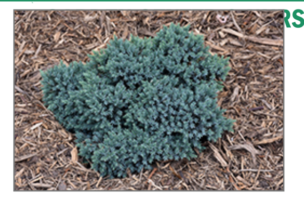
Blue Star Juniper

Blue Star Juniper will grow to be about 3 feet tall at maturity, with a spread of 4 feet. It tends to fill out right to the ground and therefore doesn't necessarily require facer plants in front. It grows at a slow rate, and under ideal conditions can be expected to live for approximately 30 years.