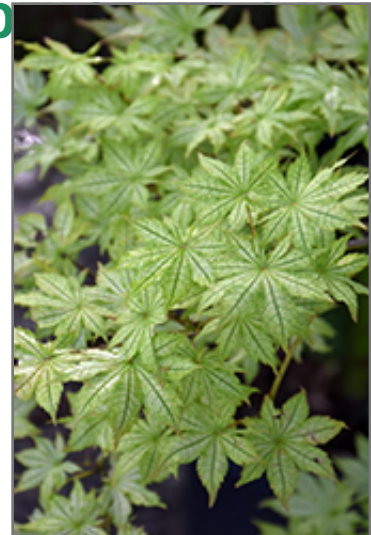
Shigitatsu Sawa Japanese Maple foliage

Shigitatsu Sawa Japanese Maple will grow to be about 8 feet tall at maturity, with a spread of 8 feet. It tends to be a little leggy, with a typical clearance of 2 feet from the ground, and is suitable for planting under power lines. It grows at a slow rate, and under ideal conditions can be expected to live for 50 years or more.