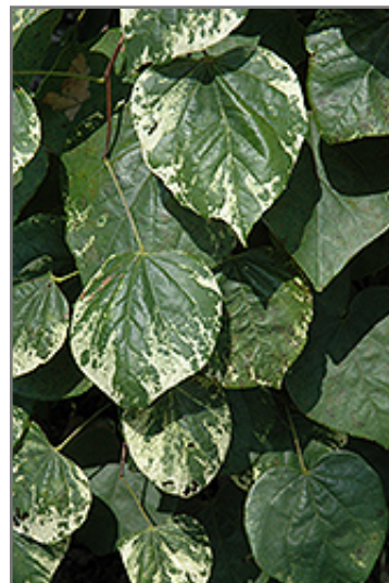
Whitewater Redbud foliage