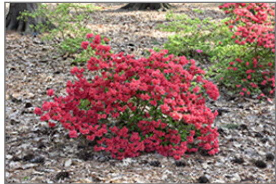
Girard's Crimson Azalea in bloom