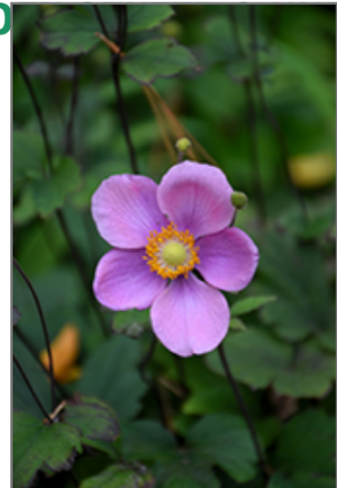
Lucky Charm Anemone flowers

Lucky Charm Anemone will grow to be about 30 inches tall at maturity, with a spread of 20 inches. Its foliage tends to remain dense right to the ground, not requiring facer plants in front. It grows at a medium rate, and under ideal conditions can be expected to live for approximately 10 years. As an herbaceous perennial, this plant will usually die back to the crown each winter, and will regrow from the base each spring. Be careful not to disturb the crown in late winter when it may not be readily seen!