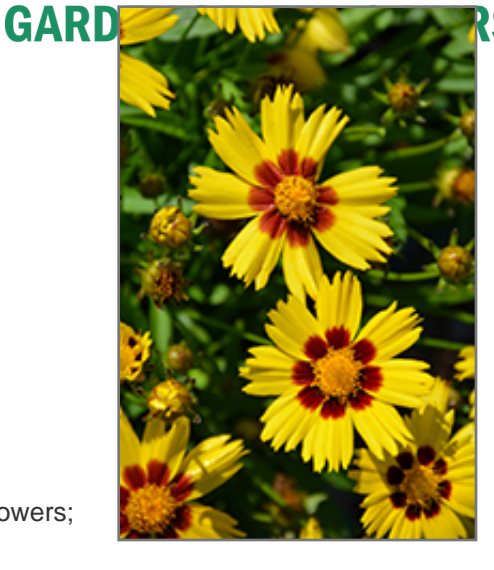
Sunkiss Tickseed flowers