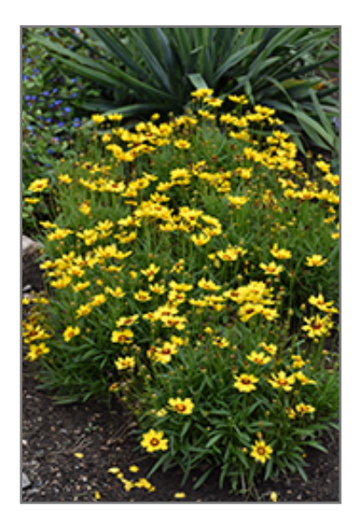
Sunkiss Tickseed in bloom