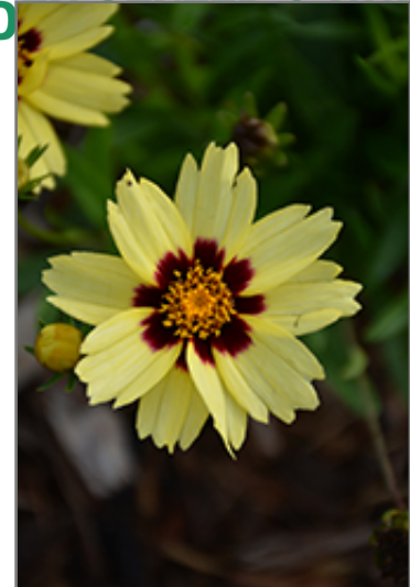
UpTick Cream and Red Tickseed flowers