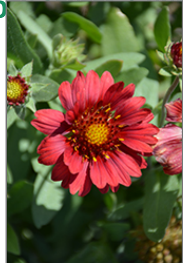
Mesa Red Blanket Flower flowers