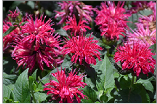
Balmy Rose Beebalm flowers