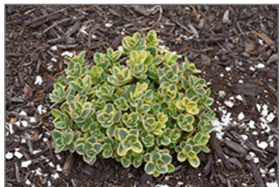
Lime Twister Stonecrop