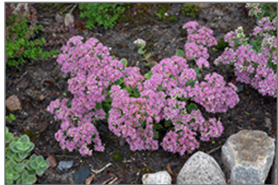
Lime Twister Stonecrop in bloom