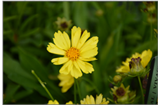
Leading Lady Sophia Tickseed flowers

Leading Lady Sophia Tickseed will grow to be about 12 inches tall at maturity, with a spread of 14 inches. Its foliage tends to remain dense right to the ground, not requiring facer plants in front. It grows at a medium rate, and under ideal conditions can be expected to live for approximately 10 years. As an herbaceous perennial, this plant will usually die back to the crown each winter, and will regrow from the base each spring. Be careful not to disturb the crown in late winter when it may not be readily seen!