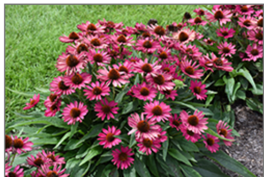
Kismet Raspberry Coneflower in bloom