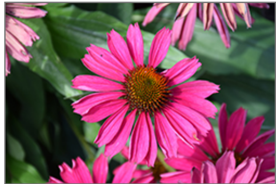
Kismet Raspberry Coneflower flowers