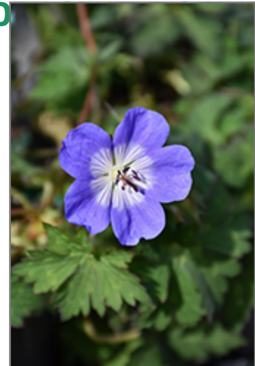
Azure Rush Cranesbill flowers