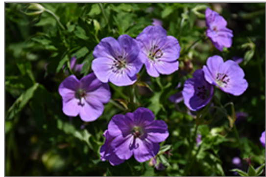
Azure Rush Cranesbill flowers