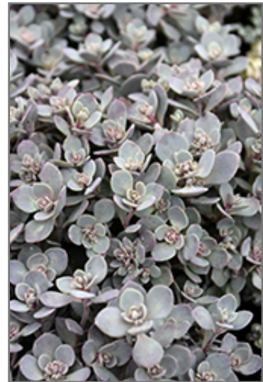
SunSparkler Blue Elf Sedoro foliage