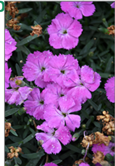
Paint The Town Fuchsia Pinks flowers