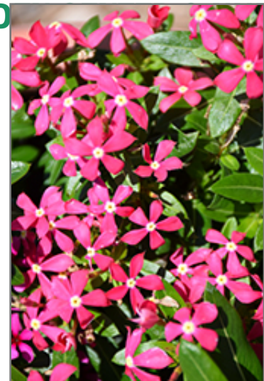
Soiree Kawaii Coral Vinca flowers