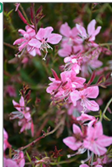
Gaudi Rose Gaura flowers