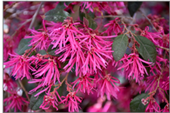
Zhuzhou Fuchsia Chinese Fringeflower flowers