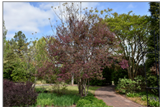
Zhuzhou Fuchsia Chinese Fringe flower in bloom