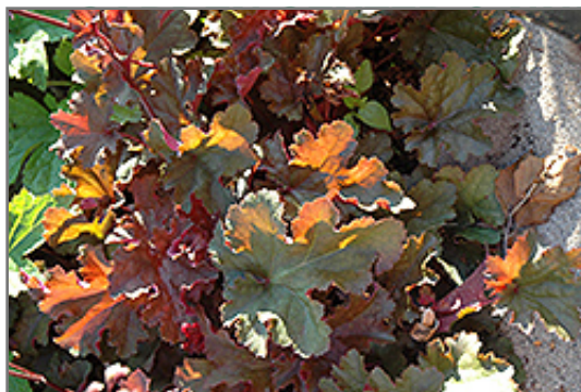
Chocolate Ruffles Coral Bells foliage

Chocolate Ruffles Coral Bells is a fine choice for the garden, but it is also a good selection for planting in outdoor pots and containers. With its upright habit of growth, it is best suited for use as a 'thriller' in the 'spiller-thriller-filler' container combination; plant it near the center of the pot, surrounded by smaller plants and those that spill over the edges. Note that when growing plants in outdoor containers and baskets, they may require more frequent waterings than they would in the yard or garden.