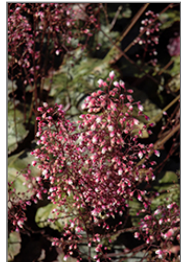
Frosted Violet Coral Bells flowers