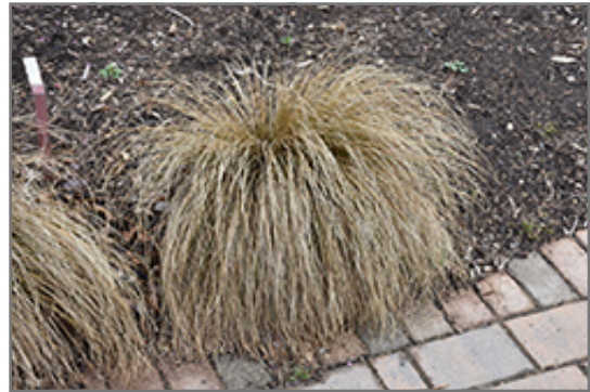
Prairie Fire Sedge