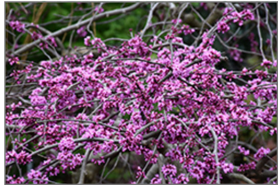
Traveller Weeping Redbud flowers