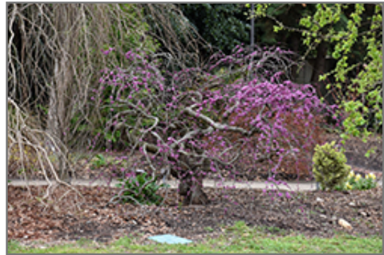
Traveller Weeping Redbud in bloom