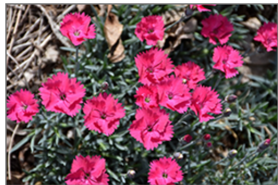
Paint The Town Magenta Pinks flowers