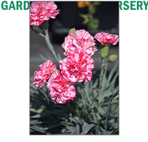
Devon Cottage Pinball Wizard Pinks flowers

11035 York Road Cockeysville, MD 21030 410.527.0700 www.valleyviewfarms.com www.facebook.com/ValleyViewFarms