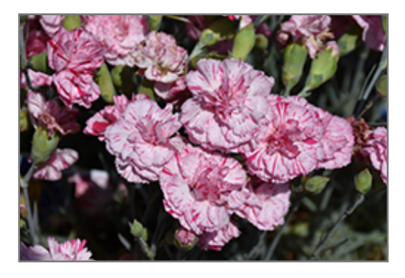
Devon Cottage Pinball Wizard Pinks flowers