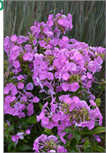
Fashionably Early Flamingo Garden Phlox flowers