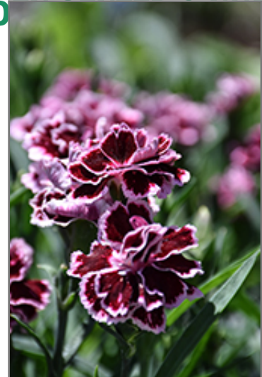
Odessa Pierrot Pinks flowers