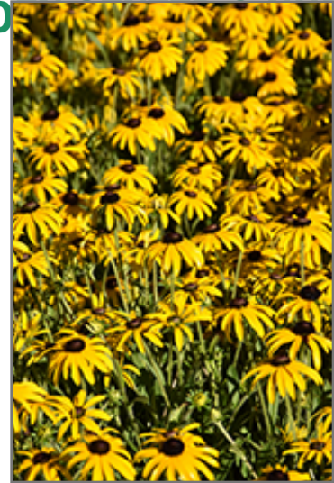
American Gold Rush Coneflower flowers

American Gold Rush Coneflower is a fine choice for the garden, but it is also a good selection for planting in outdoor pots and containers. With its upright habit of growth, it is best suited for use as a 'thriller' in the 'spiller-thriller-filler' container combination; plant it near the center of the pot, surrounded by smaller plants and those that spill over the edges. Note that when growing plants in outdoor containers and baskets, they may require more frequent waterings than they would in the yard or garden.