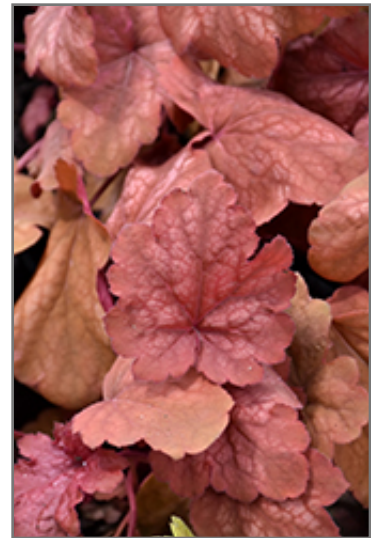
Heureka Amber Lady Bells foliage