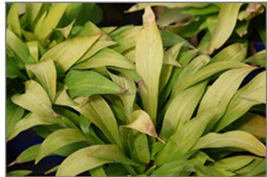
Munchkin Fire Hosta foliage