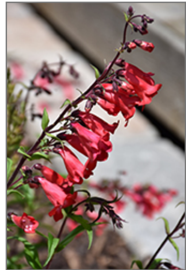
Cherry Sparks Beard Tongue flowers