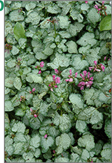
Beacon Silver Spotted Dead Nettle flowers