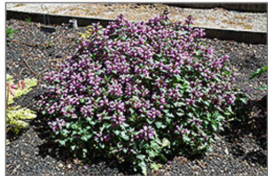
Beacon Silver Spotted Dead Nettle in bloom