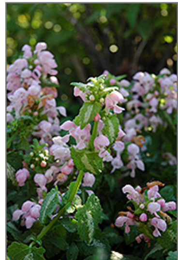
Shell Pink Spotted Dead Nettle flowers