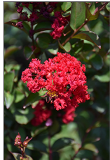
Princess Zoey Crapemyrtle flowers