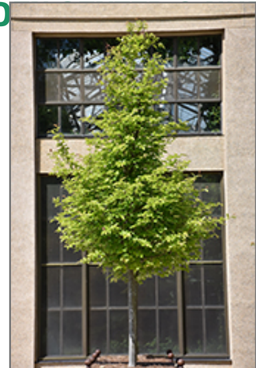
Persian Parrotia

Persian Parrotia will grow to be about 30 feet tall at maturity, with a spread of 30 feet. It has a low canopy with a typical clearance of 4 feet from the ground, and should not be planted underneath power lines. It grows at a medium rate, and under ideal conditions can be expected to live for 80 years or more.