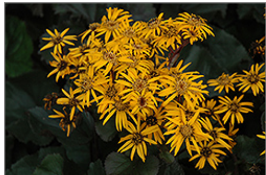
Britt Marie Crawford Ligularia flowers