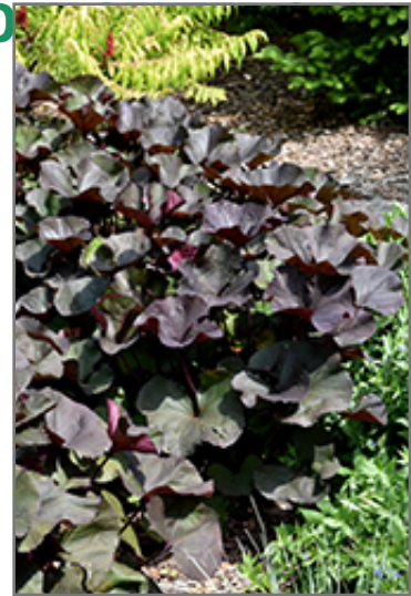
Britt Marie Crawford Ligularia foliage

This plant does best in partial shade to shade. It prefers to grow in moist to wet soil, and will even tolerate some standing water. It is not particular as to soil pH, but grows best in rich soils. It is somewhat tolerant of urban pollution. This is a selected variety of a species not originally from North America. It can be propagated by division; however, as a cultivated variety, be aware that it may be subject to certain restrictions or prohibitions on propagation.