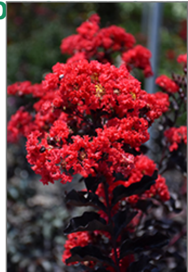
Black Diamond Best Red Crapemyrtle flowers

Black Diamond Best Red Crapemyrtle will grow to be about 12 feet tall at maturity, with a spread of 8 feet. It tends to be a little leggy, with a typical clearance of 2 feet from the ground, and is suitable for planting under power lines. It grows at a fast rate, and under ideal conditions can be expected to live for approximately 20 years.