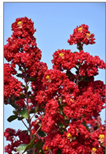
Double Dynamite Crapemyrtle flowers