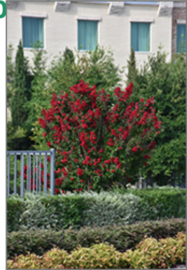
Double Dynamite Crapemyrtle in bloom