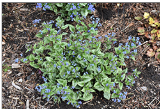
Queen of Hearts Bugloss in bloom