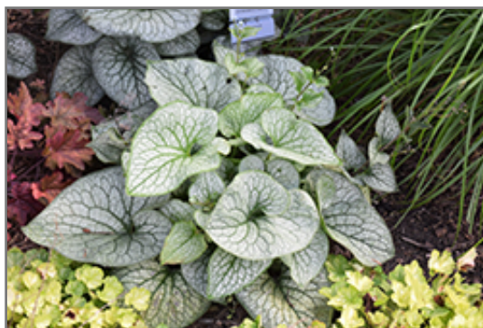
Queen of Hearts Bugloss foliage