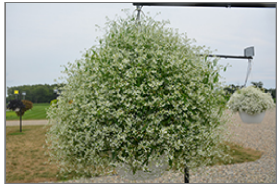
Diamond Mountain Euphorbia in bloom