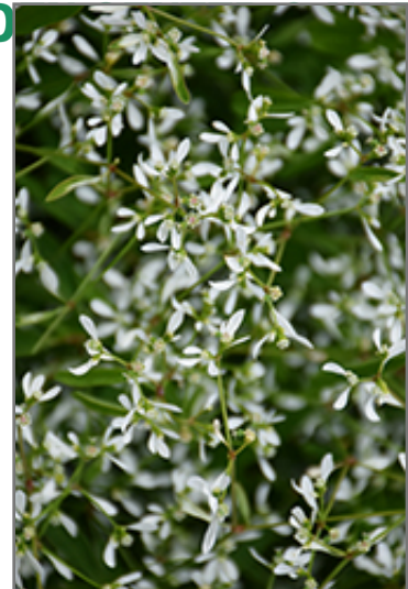
Diamond Mountain Euphorbia flowers