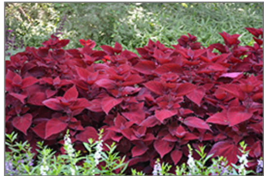
Beale Street Coleus