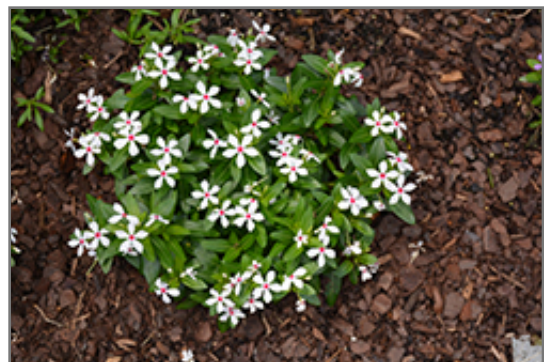
Soiree Kawaii White Peppermint Vinca in bloom