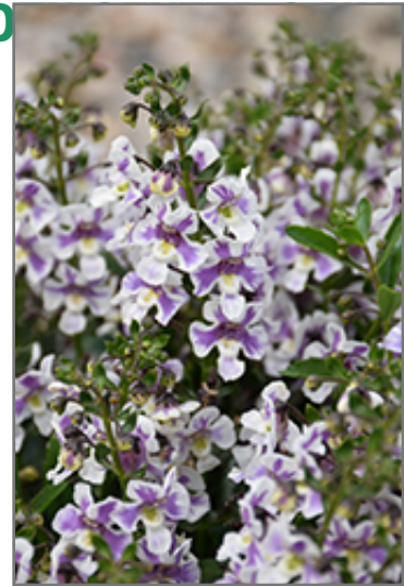
Alonia Bicolor Violet Angelonia flowers