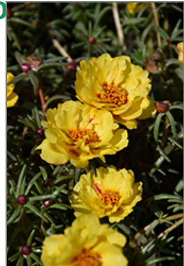
Happy Hour Banana Portulaca flowers