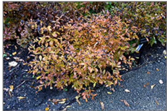
Bowman's Root in fall