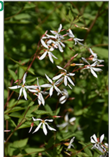
Bowman's Root flowers